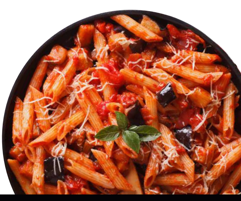
(v) - suitable for vegetarians, (ve) - suitable for vegans, (gf) - gluten free Full allergen information about our dishes is available.

(gluten free pasta available upon request)