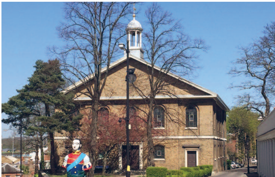
The Royal Dockyard Church

Thank you for your interest in the University of Kent.