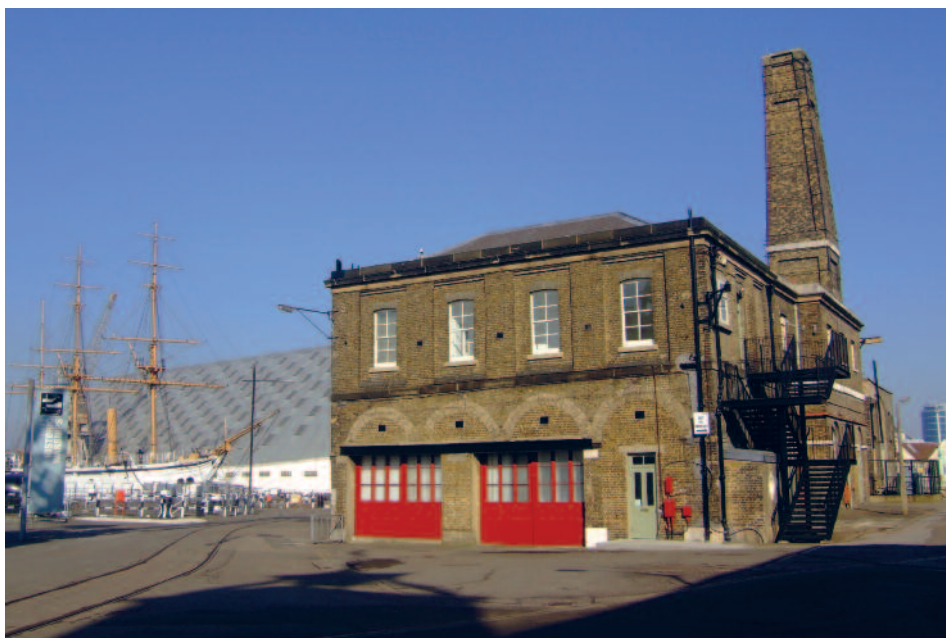
The Fire Station, which houses Music facilities

Please note: most buildings are card access only so it may not be possible to go into the buildings, unless by prior arrangement (see p5 for how to arrange appointments to visit specific academic schools).