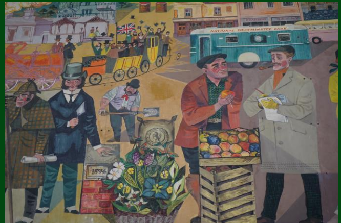
'History of Canterbury', originally displayed in NatWest bank, now in Eliot Hall

Welcome to the University's oldest College! This is where it all started when the first 500 moved into Eliot College in 1965. Named after the poet, playwright and Nobel Laureate T.S. Eliot, this College is at the heart of campus life. T.S. Eliot's play 'Murder in the Cathedral' narrates the events leading up to the murder of Archbishop Thomas Becket in Canterbury Cathedral in 1170 connecting Eliot to Canterbury. Learn more about the history of Canterbury and the history of Kent by visiting Eliot Hall - and admire the beautiful Cathedral and town views from its windows.