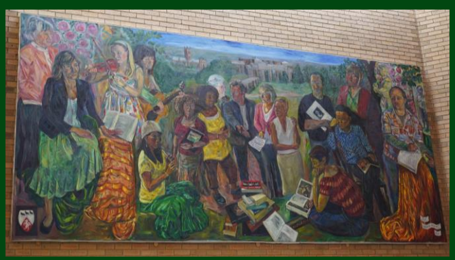
Mural in Rutherford Dining Hall

The University's second oldest college named after the physicist Lord Ernest Rutherford is a 'mirror image' of Eliot College. For some quiet time visit the commemorative garden to the right of the College's main entrance. pass the bust when you are crossing the plaza to get to the dining hall where you can view the mural picturing people from the Rutherford community.