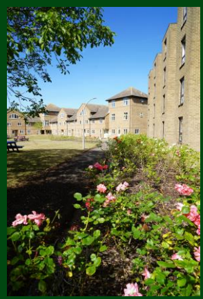
Darwin Rose Garden