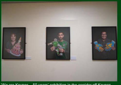
'We are Keynes – 50 years' exhibition in the corridor off Keynes Teaching Foyer