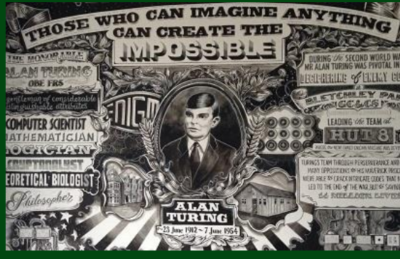
Alan Turing Mural in Hut 8