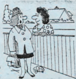
"I haven't time to listen to all the details - just give me the head-lines again!"