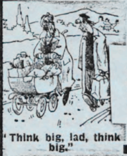
"Think big, lad, think big."

Still fed up queing? (no pun intended). Don't despair. The SU are still negotiating with the University for a better deal for us all.