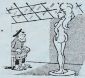
"When do you expect your paints and easel to be delivered?"