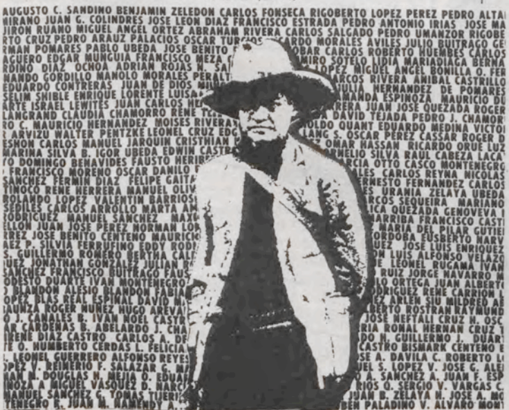
AND THOUSANDS OF OTHERS FALLEN SINCE 1927 IN NICARAGUA FOR NATIONAL LIBERATION AND DEFENCE OF THE SANDINISTA POPULAR REVOLUTION