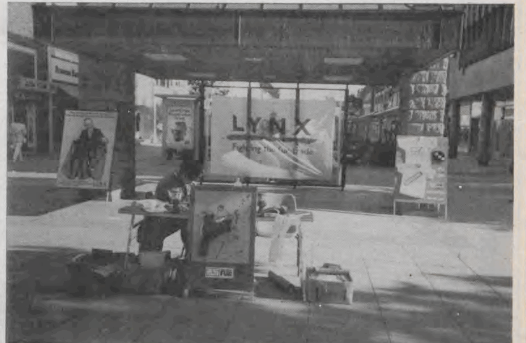
Aislinn Duffield fights for the Lynx on location

If you want more information regarding the LYNX campaign, contact LYNX, PO Box 509, Dunmow, Essex CM6 1UN.