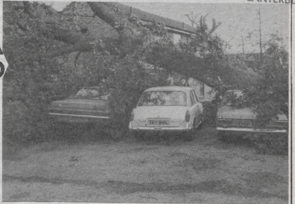
Cars which were crushed in Bishopden court Parkwood

U.K.C. on the night of 16th, was hit by the worst storm in its history. This storm or should I say "hurricane", was so intense that it left Parkwood looking like a battleground. Trees lay strown through numerous Parkwood houses, and tiles were missing from every roof. Once where bicycle sheds had stood, lay crumbled rubble. Thankfully there was no loss of life in U.K.C.'s first "hurricane"! On Friday night the Southern region was hit by immense winds. At 4.00 in the morning