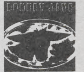
Lovefest Local Band goes to Donkey Jive for trying to push back the barriers and introduce you lucky people to World Music, with a cross between African and Western rock.