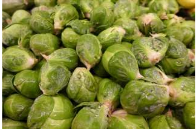
Pictures: Cauliflower, broccoli, and carrots (top left); Brussel sprouts (top right)