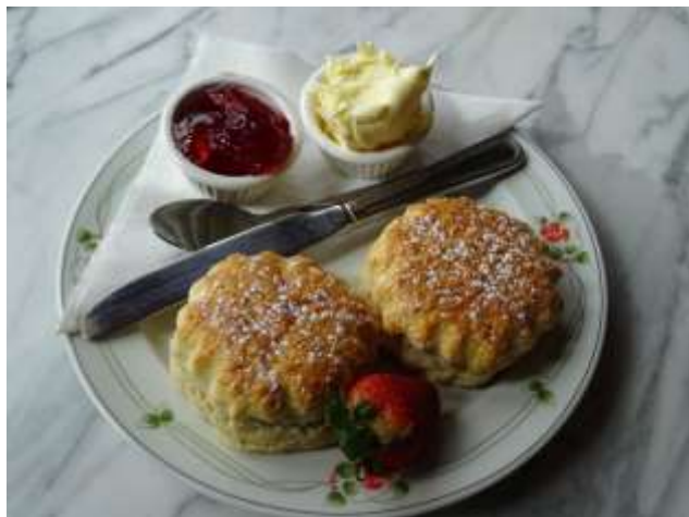
Pictures: Sunday Roast dinner with a Yorkshire Pudding (top left); Cream Tea of Scones, jam and cream (top right)